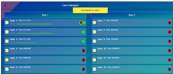
Help button is easily accessed through the ICU.