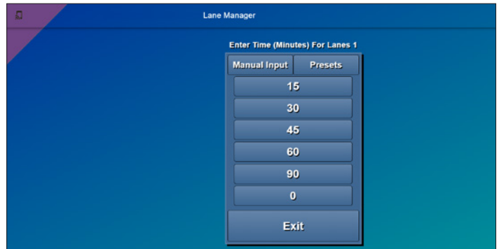
Access default time presets and manual input button.