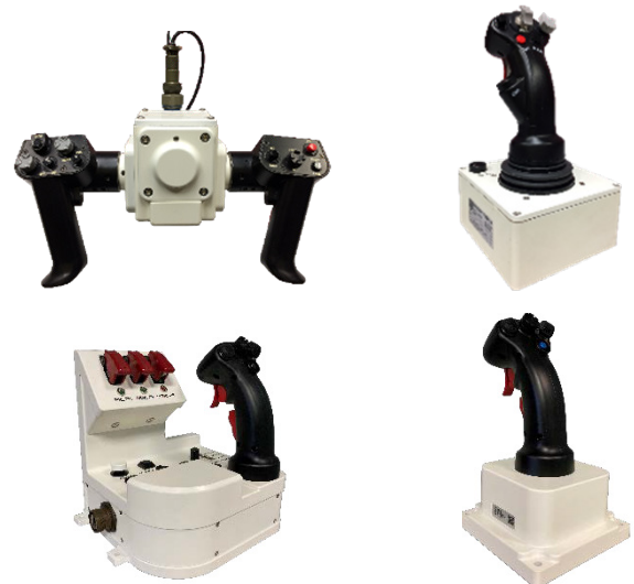
Gunner Control Grips