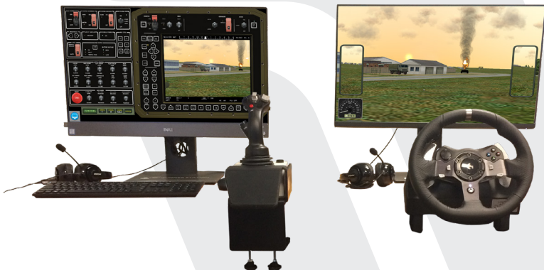
RDT running ICVD MCT30 Training with Driver