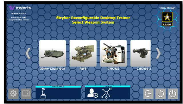
User Interface - Start Menu