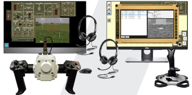
RDT running ATGM (TOW) with Commander

The Reconfigurable Desktop Trainer provides Gate-to-Live-Fire training for multiple weapon systems using a common low-cost COTS computer, touchscreen displays and replicated gunner control grips.