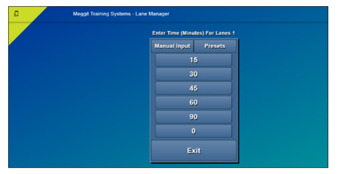
Access default time presets and manual input button.