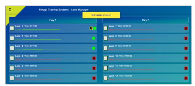
Help button is easily accessed through the ICU.