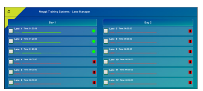
View multiple bays and lanes, time remaining and battery level.